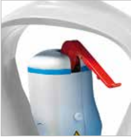
On / off lever