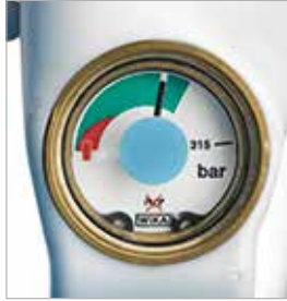
Permanent pressure gauge