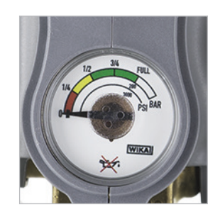
Permanent content gauge