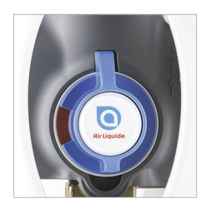
On/off hand wheel